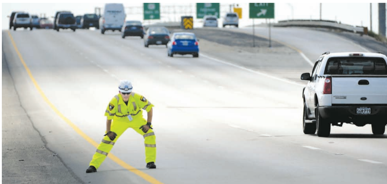
Sean Southern, a shift supervisor with the courtesy patrol, prepares to retrieve tire debris from the lanes of Loop 820.