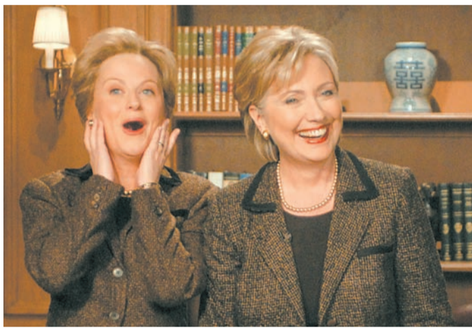
Amy Poehler, left, parodies Sen. Hillary Clinton on SNL .

And we have the candidates themselves popping up on TV, on more than just the wonky morning shows. Obama danced this month for Ellen Degeneres. McCain has made a second home on Jon Stewart's The Daily Show . And just before the March 4 primaries, Hillary Clinton hit the late-night circuit — Letter-