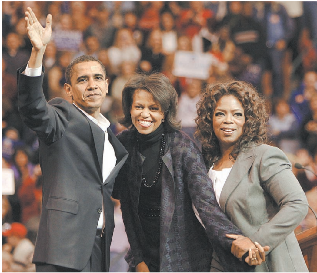
Oprah Winfrey, right, campaigns with Sen. Barack Obama and his wife, Michelle, in December.

on all the time, and when you're not near a TV you can find updates on the Web through blogs, news outlets, Twitter, Facebook, you name it. Fans can easily feed their obsession, which only cultivates more obsession.